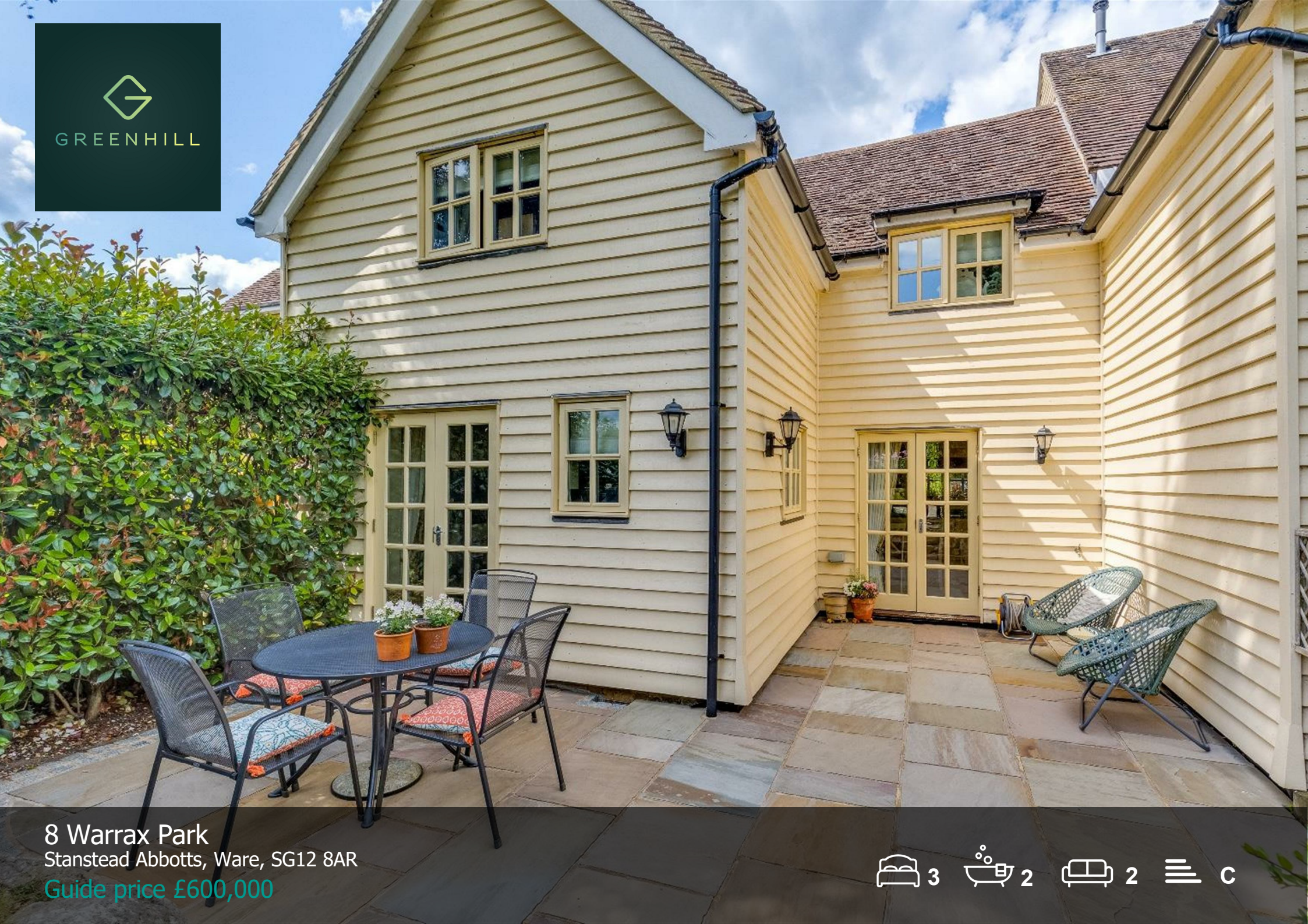
8 Warrax Park Stanstead Abbots, Ware, SG12 8AR Guide price £600,000